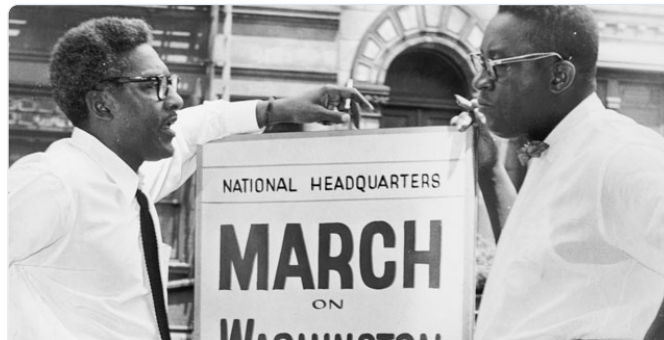
Bayard Rustin, the Gay Civil Rights Leader Who Organized the March ...

And, of course, there were a number of civil rights leaders -- Bayard Rustin, Pauli Murray, James Baldwin, to name a few -- who were themselves LGBT and naturally saw "civil rights" and "gay rights" as intertwined.